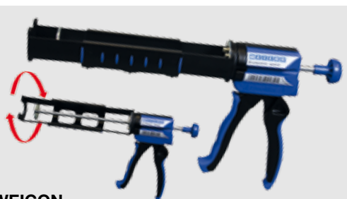
WEICON Cartridge Gun „Special“ 13250002